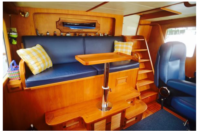
Pilothouse Berth - converts to double