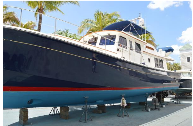
Fresh Bottom Paint