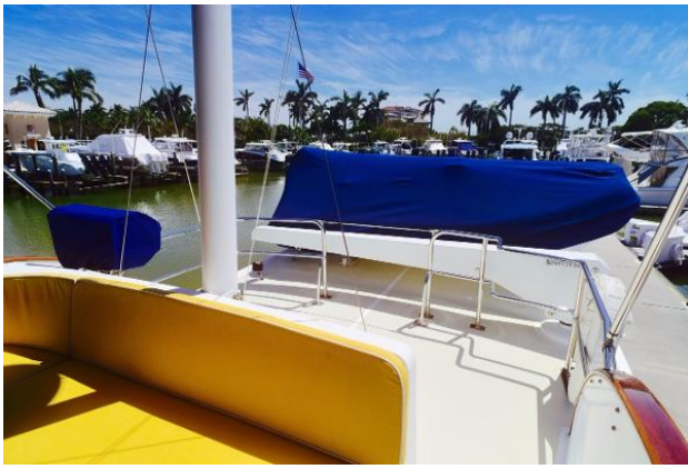
Aft Boat Deck - 11' tender and hydraulic davit