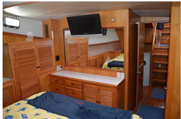
Master Stateroom - dresser and large hanging locker