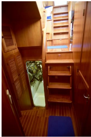
Stairs to Pilothouse and Flybridge. Engine Room door to left.