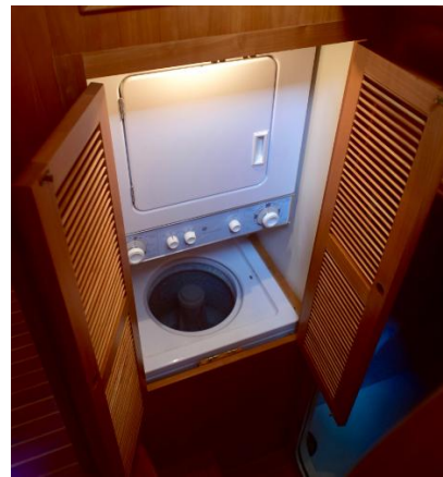
Washer/Dryer - separate and dryer vented