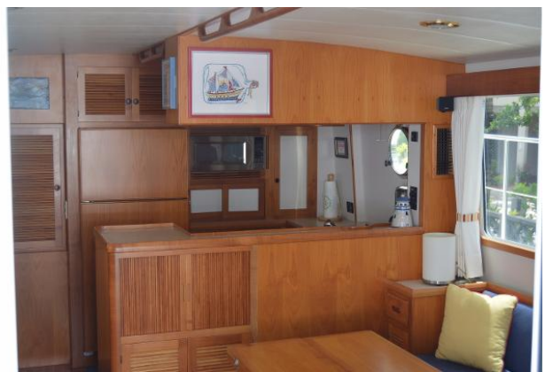
Saloon - looking to galley