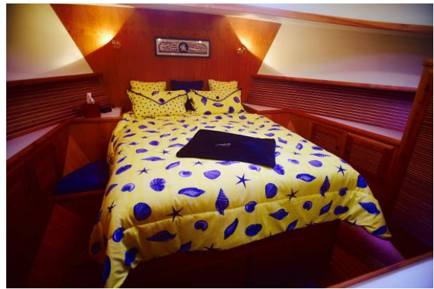
Master Stateroom - full walk-around queen