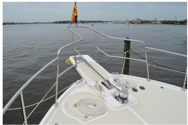
Bow Pulpit and Anchor Locker Hatch