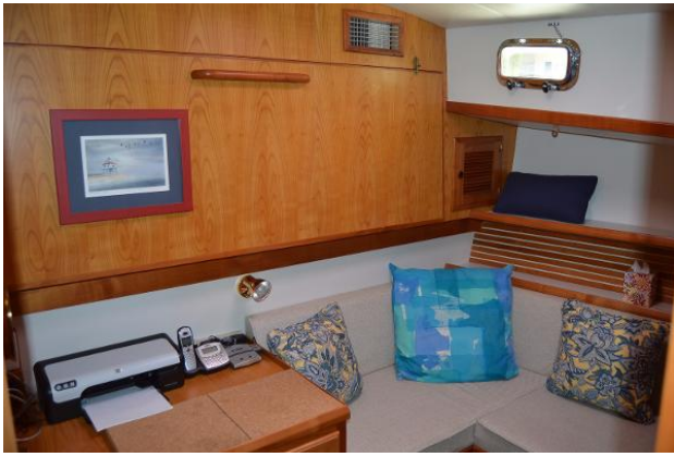
Guest Stateroom with desk and pullman berth