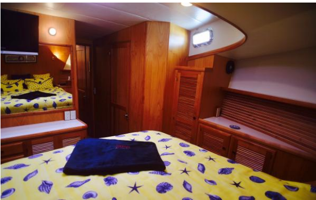
Master Stateroom - looking aft to ensuite head