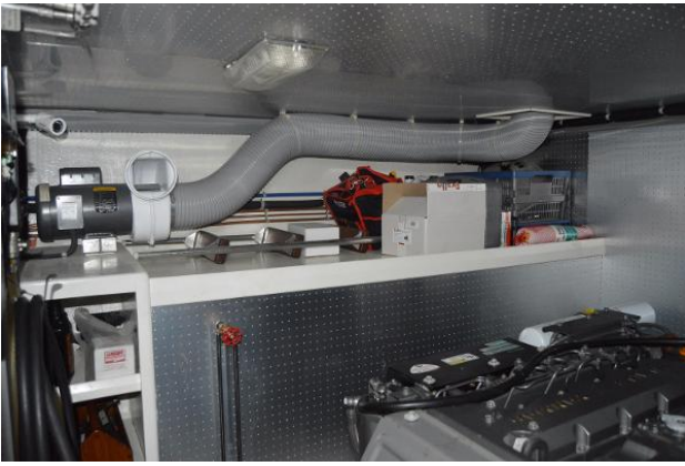
Engine Room Starboard Side