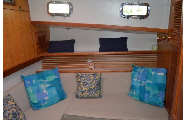
Guest Stateroom - settee converts to double