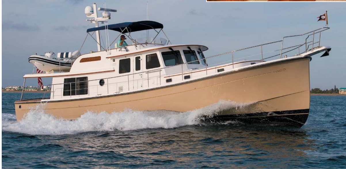
Krogen Express photos